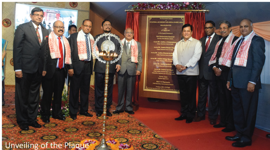
Unveiling of the Plaque

Set up under National Law University & Judicial Academy Act, 2009, NLUJAA is the only National Law University in the North East. The permanent university campus spread on a sprawling 150 bighas of land houses the Administrative Bloc, Academic Bloc, Hostel, Library and Staff Quarter.