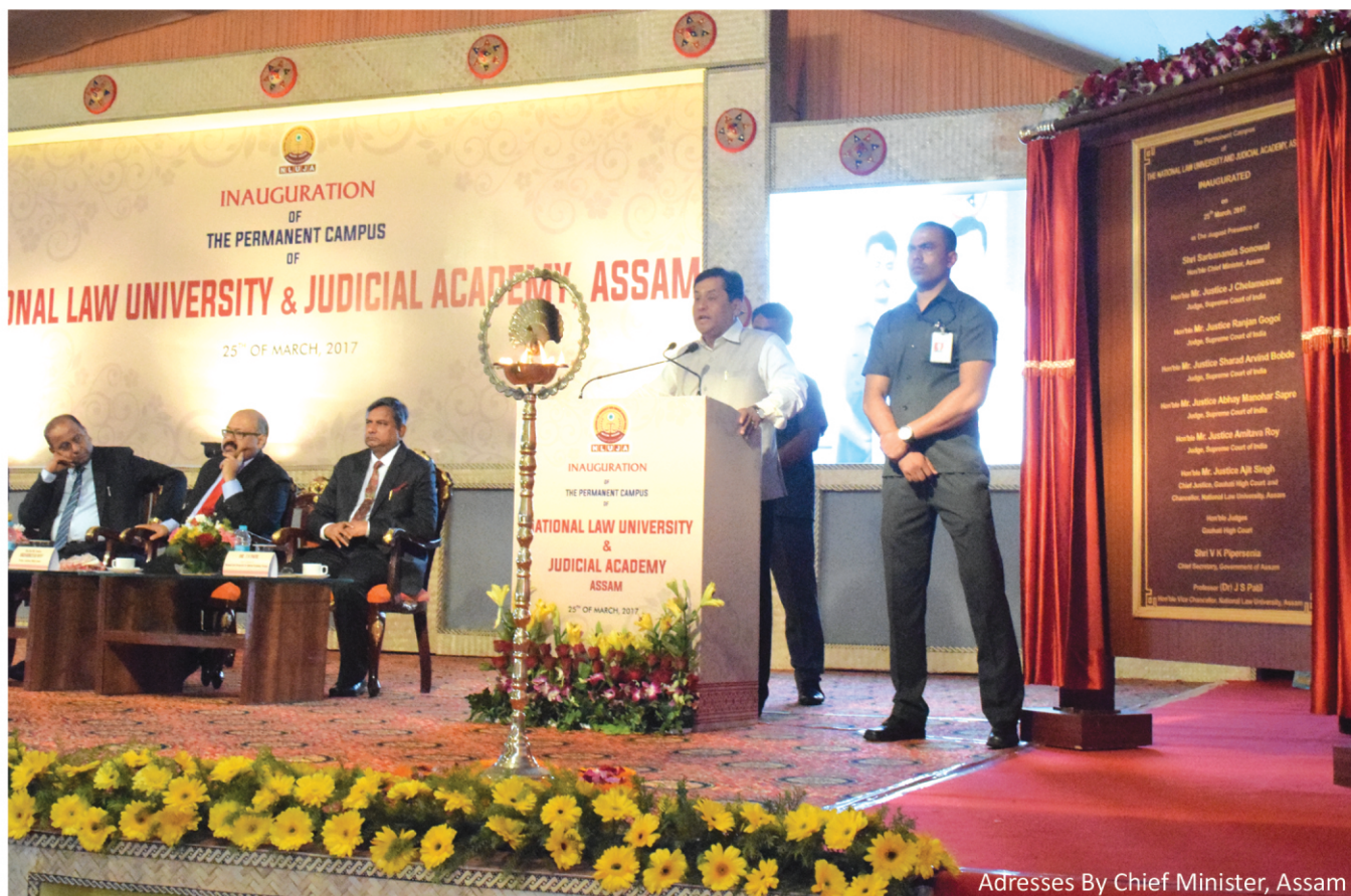
Adresses By Chief Minister, Assam