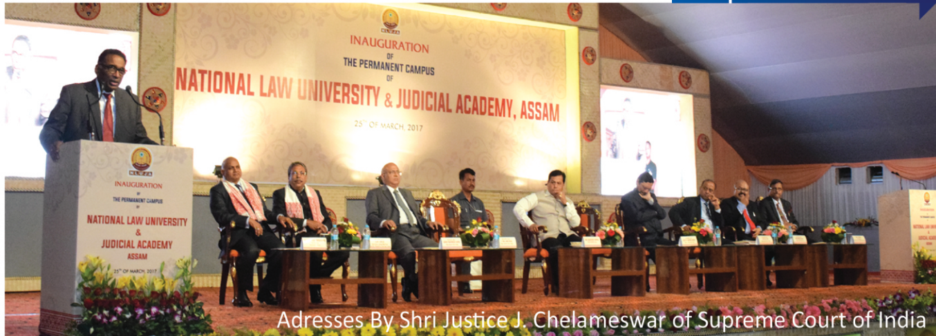
Adresses By Shri Justice J. Chelameswar of Supreme Court of India

more conscious about their Rights, the Chief Minister urged the judicial fraternity to initiate positive steps in the regard. Chief Minister Sonowal also emphasised on convergence of technology and the judicial system and advised the law students to be more abreast with new age crimes such as cybercrime, financial crime etc. and urged the students to take the calling seriously and focus more on research in legal education. Former Chief Justice of Gauhati High Court and presently Judge of Supreme Court of India Justice J. Chelameswar while speaking on the occasion highlighted the background that led to setting up of National Law University in Assam. Appreciating the role of legal education in establishing and nourishing the spirit of democracy, Justice Chelameswar lamented that the nation has yet to fully understand the basic tenets of democracy. "Indian democracy is in a nascent state and for making people understand the content of constitutional culture, young generation will have to play a significant role. Referring to the legal system as an important constituent of constitutional governance, Justice Chelameswar advised the law students not to be swayed away by precedent culture and to devote quality time on analysing problems. He also advised the practising lawyers and judges to improve efficiency level to reduce pendency of court cases.