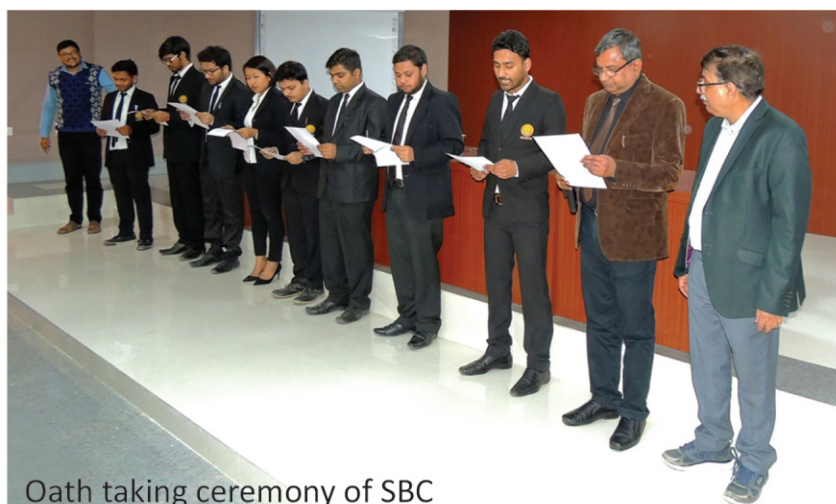
Oath taking ceremony of SBC