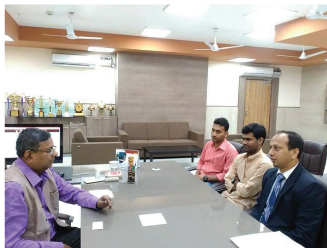
Interaction with judges of Parliamentary Debates Competition of ADUJ